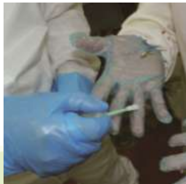
Hand and fingers

Stick is able to concatenate 1. 2 or 3 pieces.