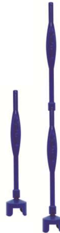
Accessory: Extension tool

Left: capper + stick x 1 Right: capper + stick x 2