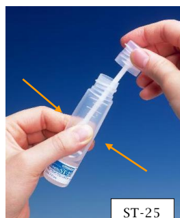
Squeeze swab bud to remove excess diluent.