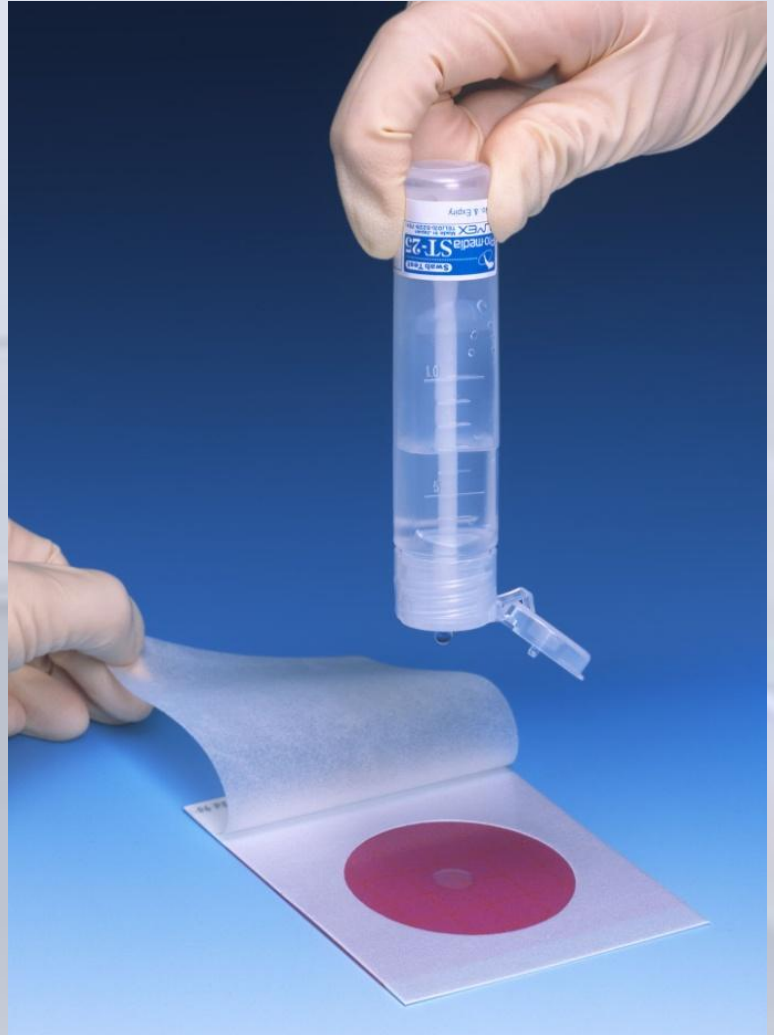
Above medium is 3M Petrifilm