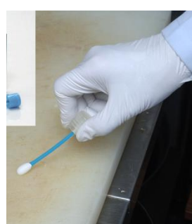
Mix to suspend.